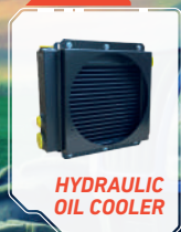
HYDRAULIC OIL COOLER