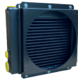
5.1.6 HYDRAULIC OIL COOLER