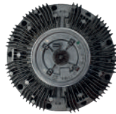
1.1.3 VISCIOUS FANS