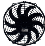
2.1.8 ELECTRIC FANS