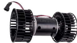
2.1.6 CABIN BLOWERS